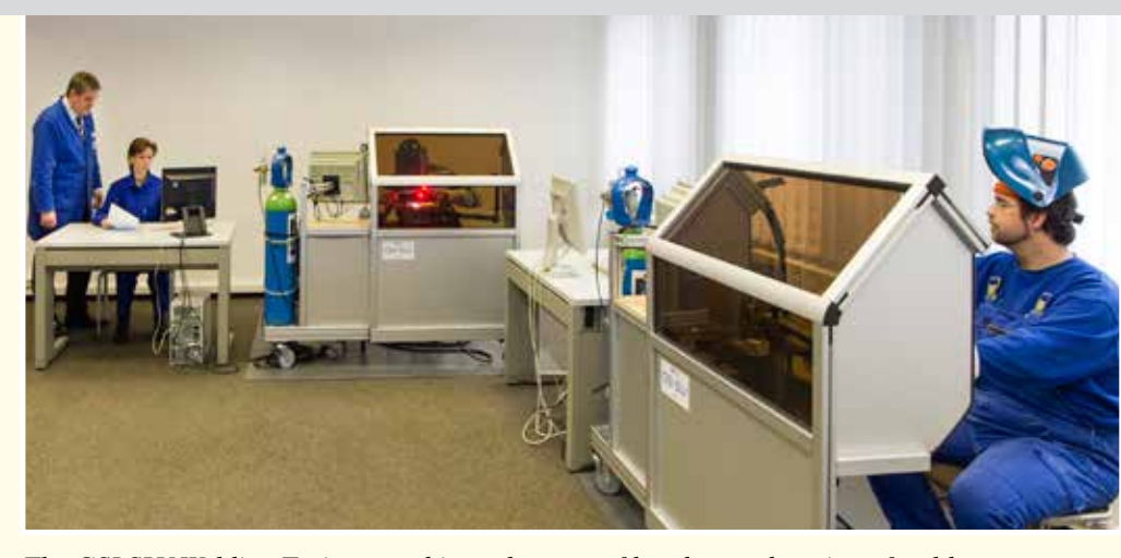
The GSI SLV Welding Trainer combines elements of hands-on education of welders and computer-based simulation to educate welders as realistically as possible