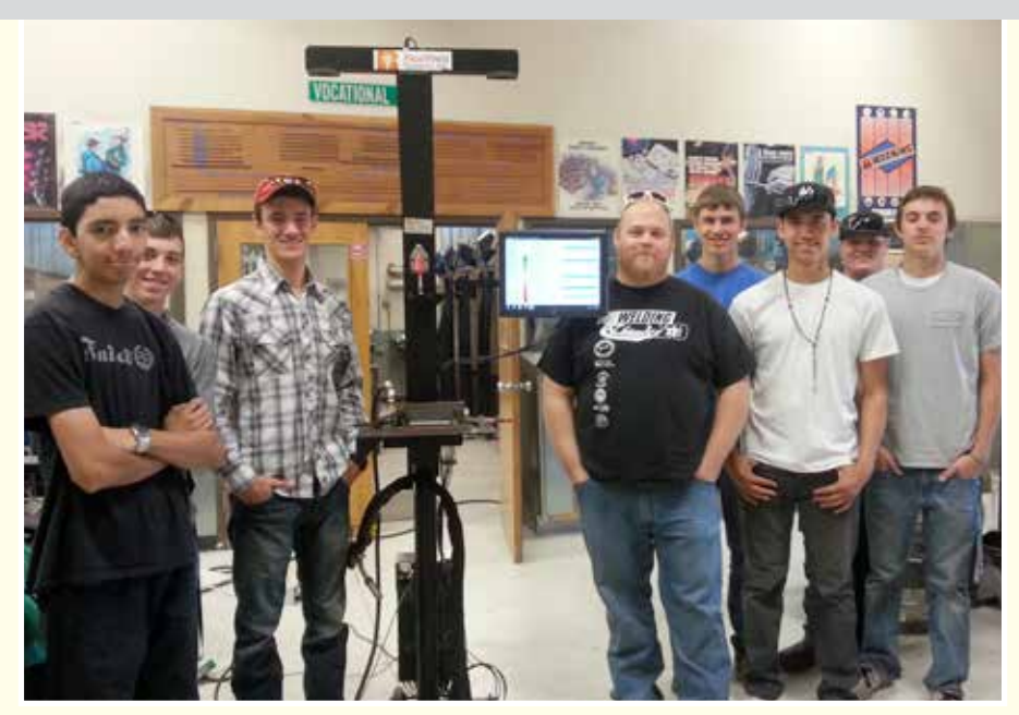
A welding class in the USA utilises the RealWeld Trainer to give real-time feedback on live welding using standard welding machines and procedures, as well as practice welding with the arc-off

real time, allowing immediate correction of technique.