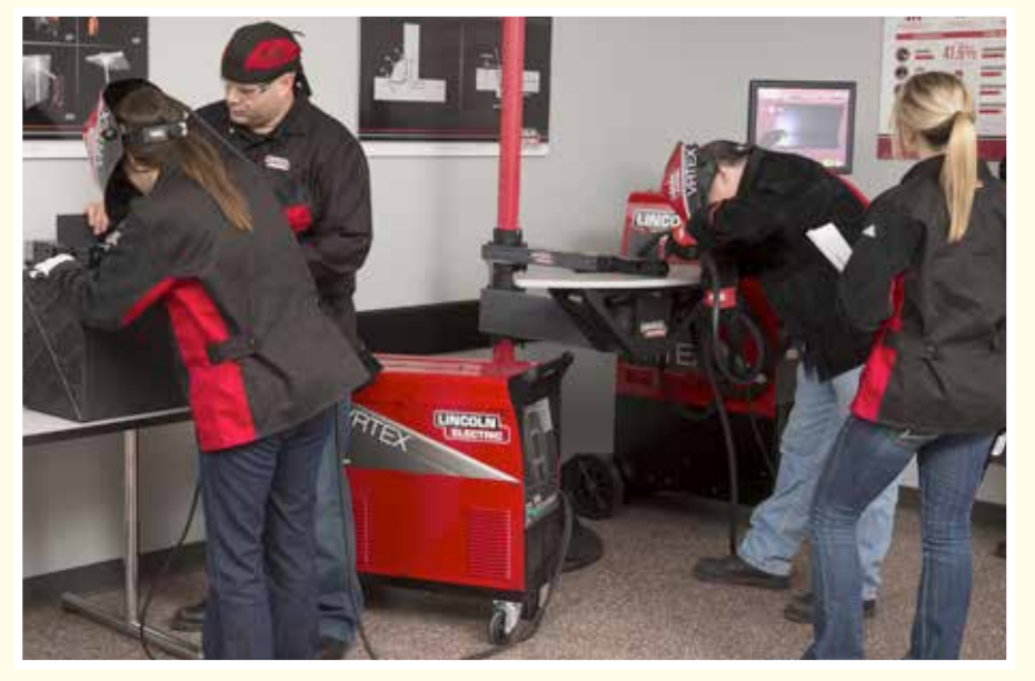
Training with the Lincoln VRTEX 360

The Lincoln Electric VRTEX 360 is a virtual reality training system that enables welders to be trained better, faster and at lower cost. As an interactive welding simulator it uses a welding gun and helmet connected to a CPU about the size of small generator. The helmet includes speakers and 3D goggles, through which the trainee sees a virtual welding gun and work site, such as a high-rise or welding booth. Speakers in the helmet broadcast the tell-tale pop and sizzle of materials being melted and joined.