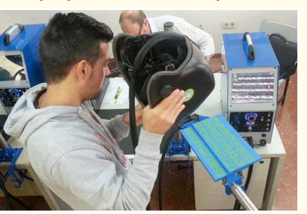
Soldamatic Augmented Training – not just a trainer-simulator for welding but a comprehensive educational solution

With up to 180 systems already in service in over 25 countries, Marquinez highlighted the value of remote maintenance and customer service which the company provides in real time worldwide. The website is also utilised to deliver customer care to end users and distributors, while applications for smartphones and tablets appeal to younger generations and aid in the recruitment of students to training